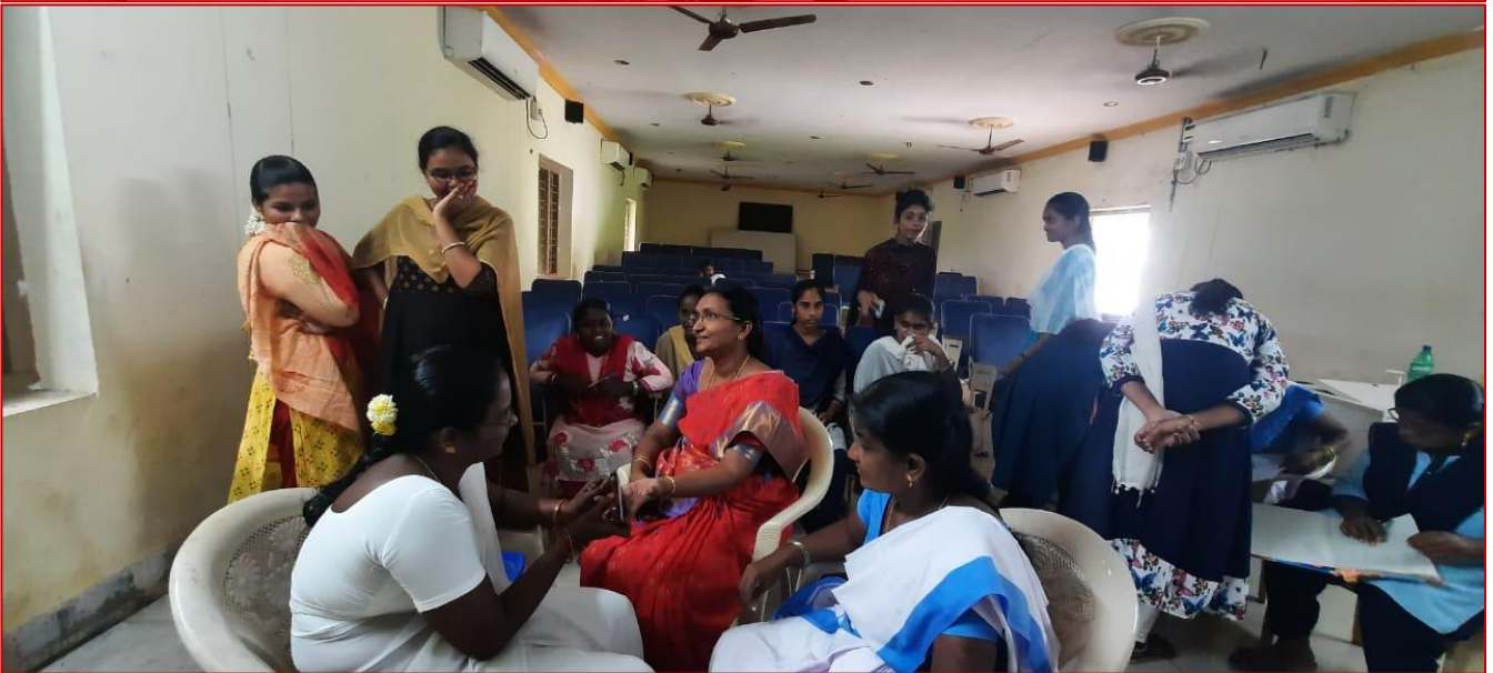
HEMOGLOBIN TESTS AT MANA TV HALL