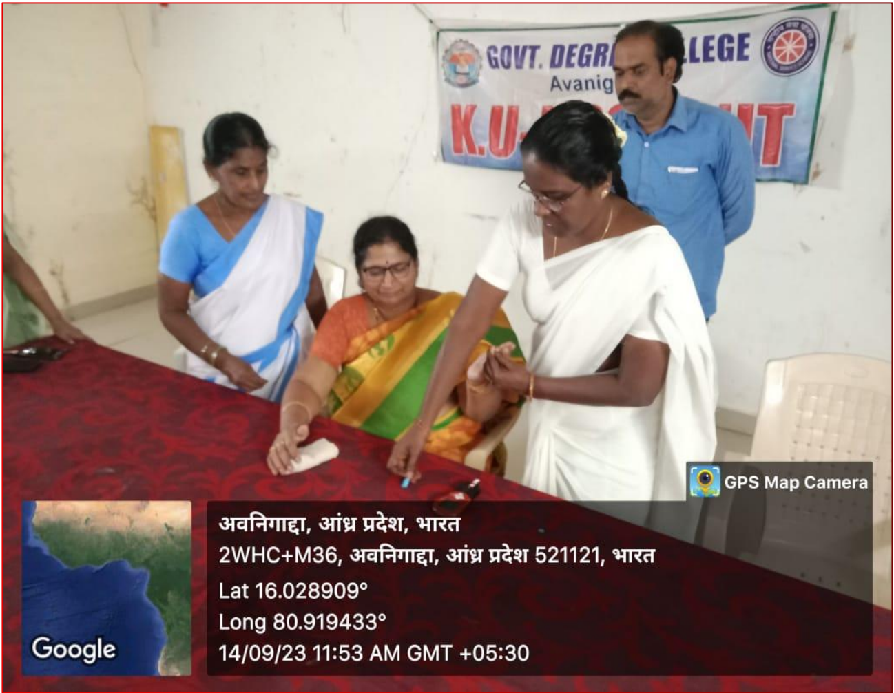
Principal getting Hemoglobin tests by Medical department